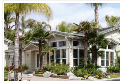
Model home on display!

At homeownership fairs and other events planned across the country throughout this week, manufactured and factory built housing companies including CMHI members will reach-out to potential homebuyers, decision makers and opinion leaders to provide them with information on the quality and efficiency of factory constructed homes. They will also discuss the role homeownership plays in helping families build wealth and strengthen their communities.